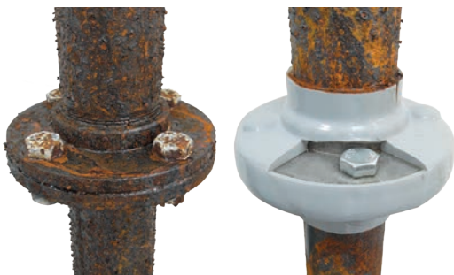
Unprotected corroded flange - Successful protection with Oxifree TM198